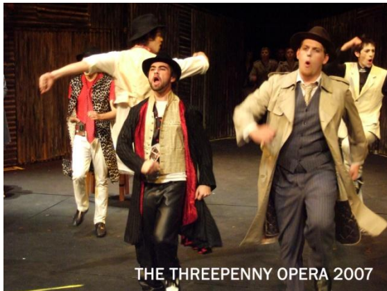
THE THREEPENNY OPERA 2007