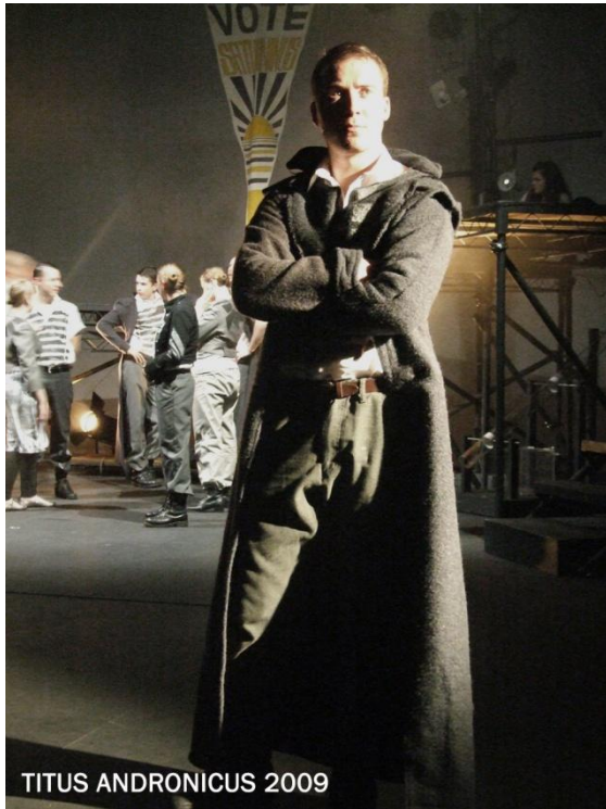
TITUS ANDRONICUS 2009