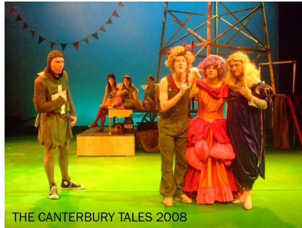
THE CANTERBURY TALES 2008